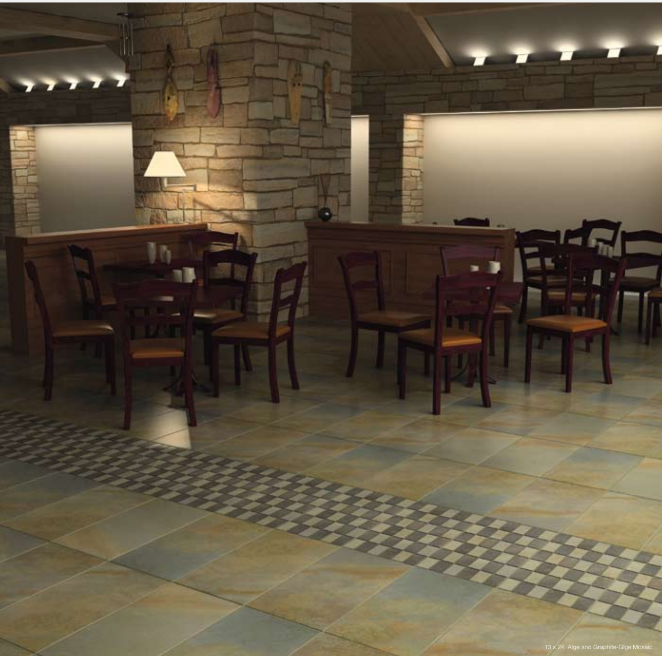
13 x 24 Alge and Graphite-Glge Mosaic