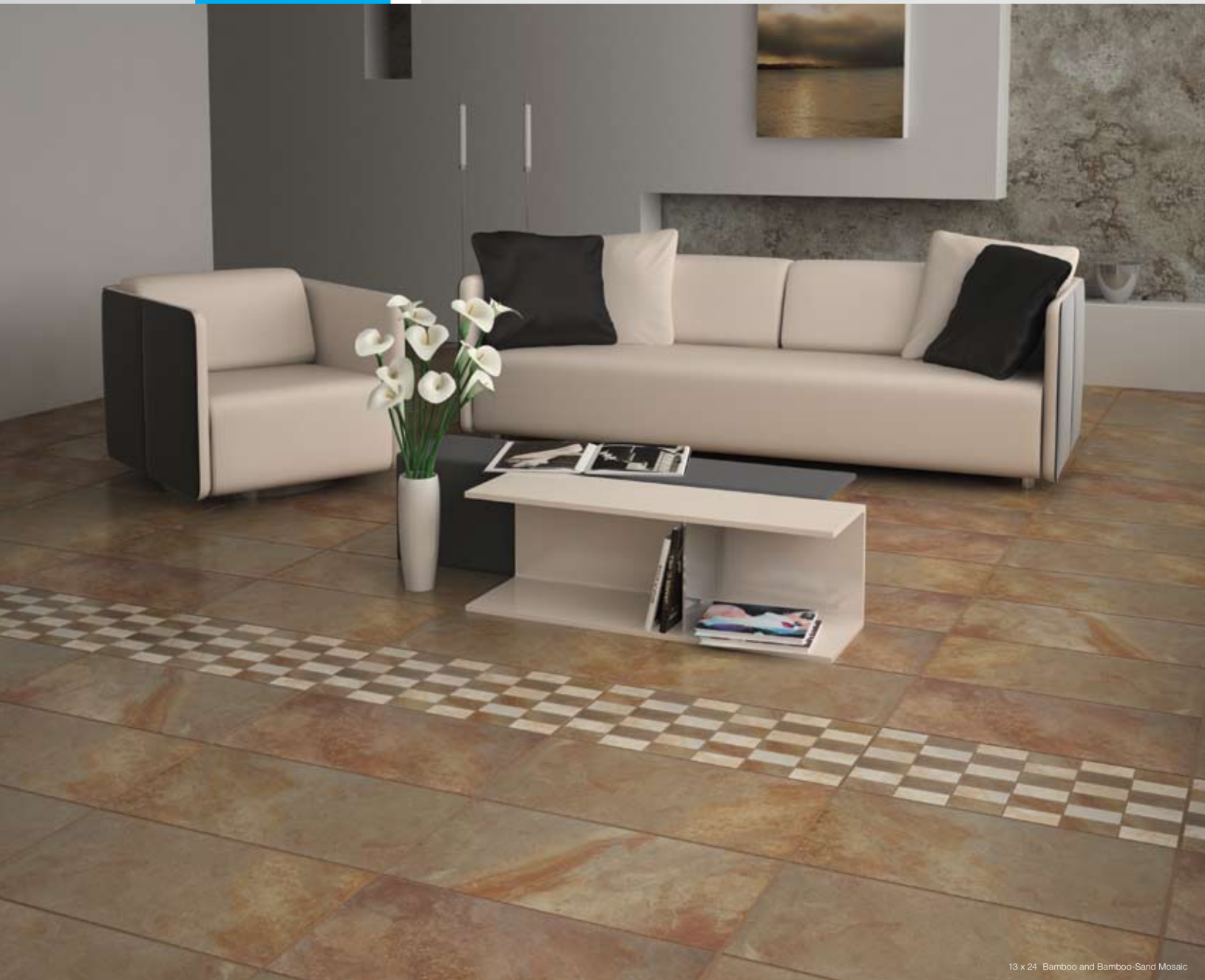
13 x 24 Bamboo and Bamboo-Sand Mosaic